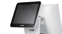
2nd Display • 9.7", 12.1", 15" LCD