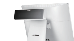
Customer Display • VFD (2 Lines x 20 Characters)